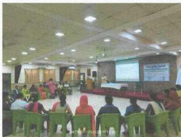
Capacity building on POSH