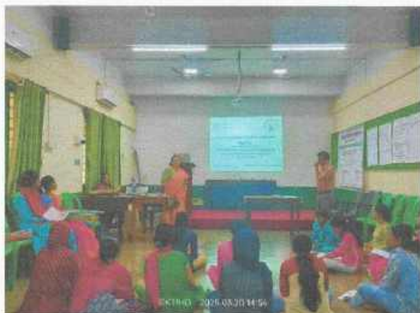
Capacity building on Child Safeguarding