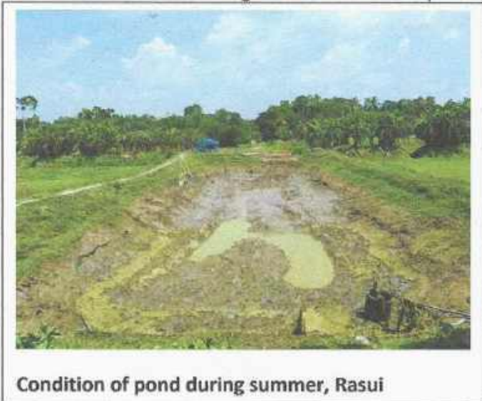
Condition of pond during summer, Rasui

KTfHD has been actively supporting the initiative through its capacity and understanding. In 2023-24 KTfHD representatives supported in school letter exchange programme between the students of Herrsching schools (one primary and one higher secondary co-education) and Chatra schools (One Primary and two Higher secondary-Girls and Boys separately). During the year, three members of BoT of KTfHD attended delegation visit to German partner schools at Herrsching and presented Indian school, education system, social system etc. Infront of a larger number of school students, teachers and the principal. Besides, KTfHD actively participate as an important stakeholder of "Safe Drinking Water Project (SDWP)" project for some selected villages of Chatra Gram Panchayet, under adelphi research gGmbH, Berlin, which is financed by IH. This initiation was aimed for providing arsenic contamination mitigating solutions for neediest inhabitants of Chatra and possibly in the long term.