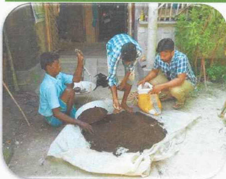
Community Members selling Vermi compost

Romeja's story reflects how small but timely interventions can open new opportunities for women in rural households. Her willingness to adopt vermicomposting has brought her both income and dignity, and she now stands as an encouraging example for others in her village to explore sustainable and low-cost livelihood practices.