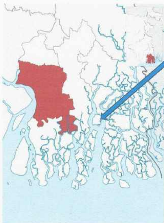
Diamond Harbour II Block of South 24 PGS