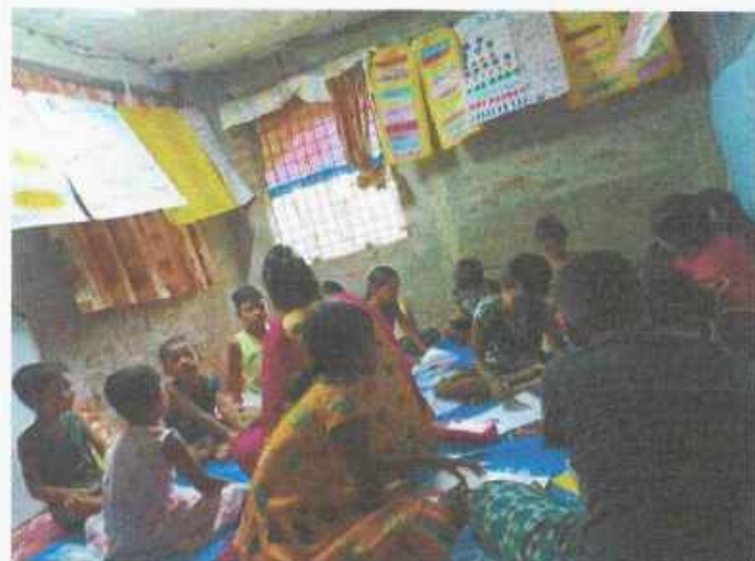
Participants engaged in Bridge Centre Activities