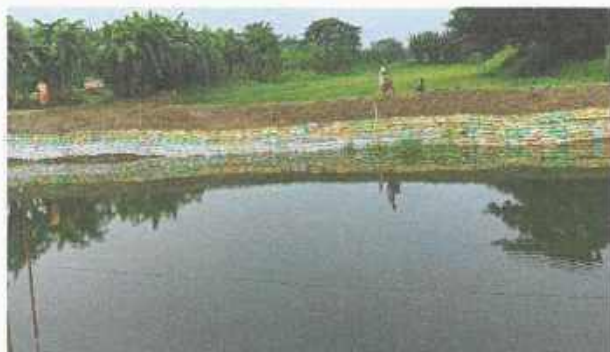
Pond Protection Activities started in 2024

Groundwater arsenic contamination has long been a major issue in Chatra, first highlighted during the town-twinning partnership with Herrsching Municipality in 1996. To address this, the Safe Drinking Water Project (SDWP) was initiated in 2016 by Indienhilfe and Adelphi Research gGmbH, with technical and institutional support from partners including Gemeinde Herrsching, AWA Ammersee, Hijji INSPIRATION, Jadavpur University, and the Technical University of Munich. A pilot plant serving around 150 households in Rasui Paruipara—an area with a high concentration of disadvantaged communities was developed, sourcing water from a nearby pond linked to the Padma River, and became operational in June 2022. While the plant has been running successfully, contamination risks from adjoining water bodies and the growing impacts of climate change highlight the need for additional safeguards.