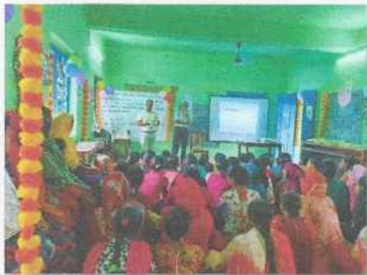
Reading and Learning Camps

The ILD project's Library-Based Reading Activities created a joyful and engaging learning environment for children who otherwise had limited access to books. All enrolled children actively participated, averaging 25 hours (in a quarter) of guided reading sessions months while over 90% of children across the centres developed a greater interest in reading. These libraries have become more than just book corners, they are safe spaces where children nurture curiosity, strengthen language skills, and build a lifelong love for learning.