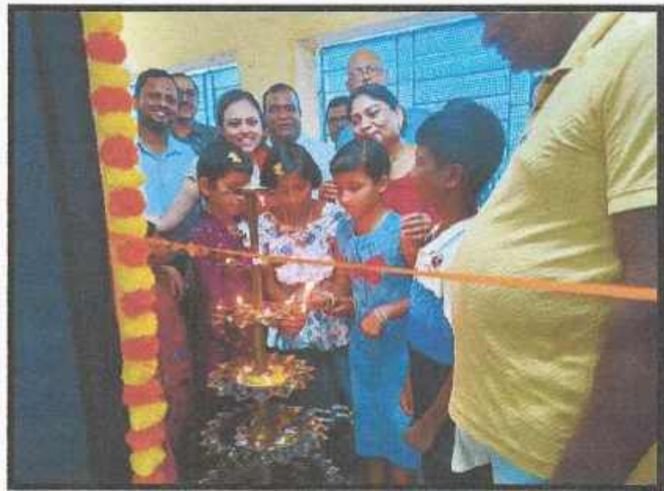
Inauguration of Library

The ILD project's Library-Based Reading Activities created a joyful and engaging learning environment for children who otherwise had limited access to books. All enrolled children actively participated, averaging 25 hours (in a quarter) of guided reading sessions months while over 90% of children across the centres developed a greater interest in reading. These libraries have become more than just book corners, they are safe spaces where children nurture curiosity, strengthen language skills, and build a lifelong love for learning.