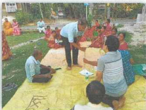
Community Awareness Programme