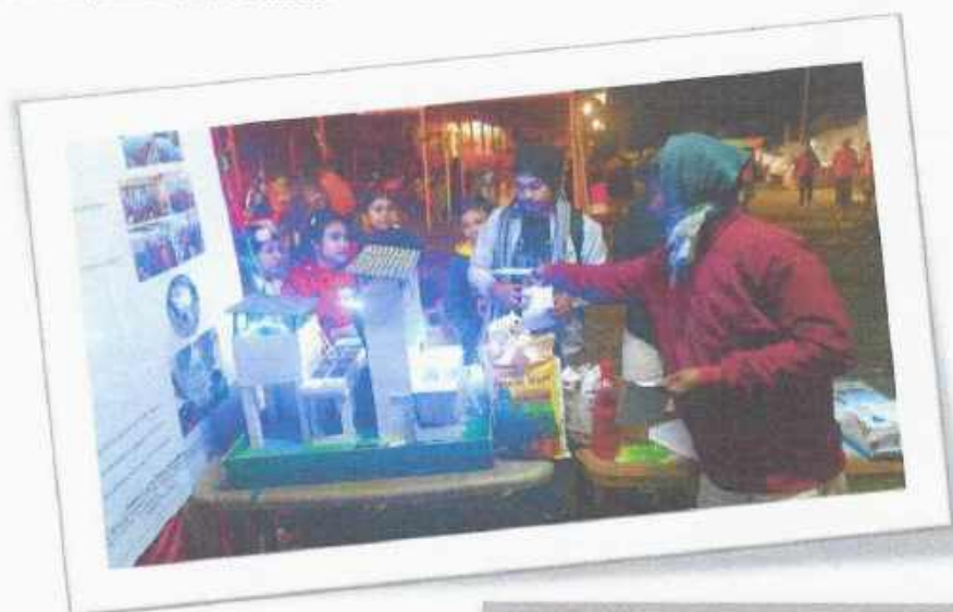
KTfHD Project Stall at Chatra Milan Bithi Festival

So far, the strategies of the GPSD project have showcased a scalable and replicable model that can inspire similar interventions in other vulnerable regions. By integrating community ownership, child education, safe drinking water, and local governance , the initiative demonstrates how holistic and cost-effective approaches can deliver lasting impact. Its strong focus on community capacity building ensures that the model is not confined to a single project but is adaptable across diverse contexts. Once the community-led distribution and financial control of O&M are fully established, GPSD will stand as compelling evidence that with the right support, small communities can drive transformative change creating models that can be replicated across villages, districts, and even states.