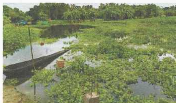
Semi constructed infrastructure washed away due to sudden rise of water level of perineal river Padma

In 2024, severe floods across West Bengal had a major impact in Baduria and the CSSWR project location, damaging infrastructure and destroying the newly constructed earthen band under the CSSWR project. Waterlogged and flood conditions lasted till the end of December 2024, starting from the monsoon. This unexpected setback posed significant challenges to the continuity of planned activities. KTfHD responded by reassessing the situation by January 2024 , revising the implementation plan, preparing a new proposal and budget, and engaging a new contractor to ensure quality restoration. Despite the disruption, by the end of the financial year, the project had regained momentum, and progress was assessed as satisfactory , demonstrating KTfHD's resilience and ability to adapt in the face of climate-related challenges.