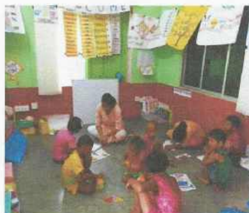
Bridge Centre Activities