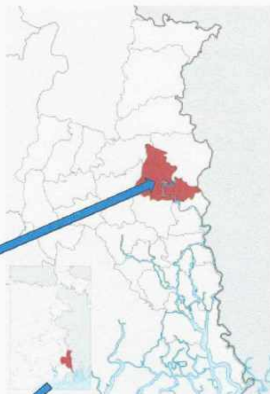
Baduria Block of North 24 PGS