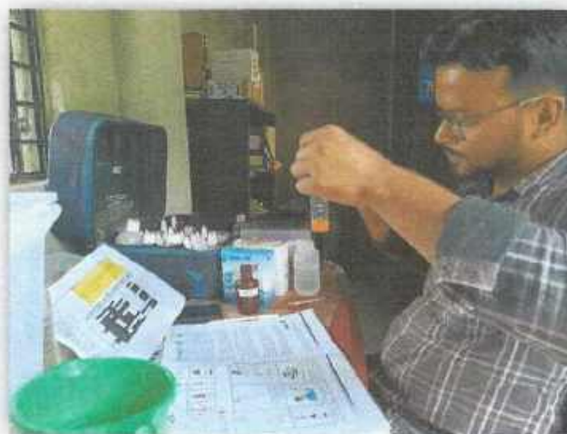
Water Quality Testing regularly done by GPSD staff

Since 2016, Indienhilfe e.V. has been partnering with KTfHD to strengthen the town-twinning initiative and conduct operational and maintenance activities related to the surface water-based drinking water treatment plant with (near natural multi-stage filtration technology), established under the International Town Twinning NaKoPa Project Tomar Jol Asche / Dein Wasser Kommt in 2021). The programme innovates the natural treatment of surface water to provide safe drinking water for rural communities. In the Baduria block , where groundwater is heavily contaminated with arsenic, this initiative offers a vital alternative to unsafe tube wells that many families depend on. Through effective linkage strategies and strong local engagement, KTfHD successfully secured public land and sustainable water sources (river and pond) to establish a community-managed village water treatment plant , ensuring long-term access to clean, arsenic-free drinking water.