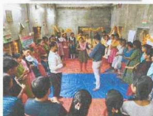
Child Protection Awareness

Through the Integrated Learning and Development (ILD) project, KTfHD has brought measurable change in the lives of disadvantaged children and their families. Out of 500 enrolled children, 93% attended over 280 hours of sessions, resulting in significant learning gains 74.8% improved in Bengali, 58.3% in English, and 65.8% in Mathematics, compared to grade V-VI age-wise competency standards. Beyond academics, 383 adolescents (15+ years) participated in protection and creative camps, while 40 community meetings and 60 stakeholder engagements strengthened awareness on child protection issues. Most notably, reported child marriage cases declined from 72 to around 30 within a year, reflecting a powerful shift in community attitudes and safeguarding practices.