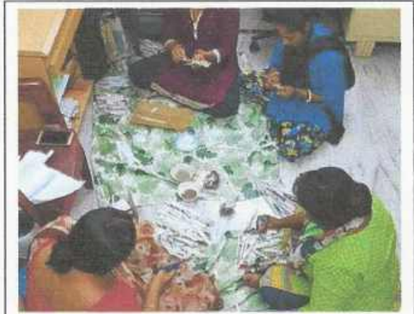
Community people making Green-pen

The "Green Pen" initiative is a stepping-stone for promoting Green and Sustainable environment to ensure a quality life for our beloved children. The use of Green Pen will create awareness amongst the children of the society and enhance the responsibility towards nature and environment from young age.