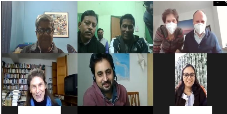
Picture 7: Online Exchange Programme with Two Municipalities (Hersching and Chatra) where KTfHD members supported on

This year KTfHD representatives also participated in Online Exchange Programme Online Exchange Programme with Two Municipalities (Hersching and Chatra) where KTfHD members supported on communication and advocacy (1.2.21)