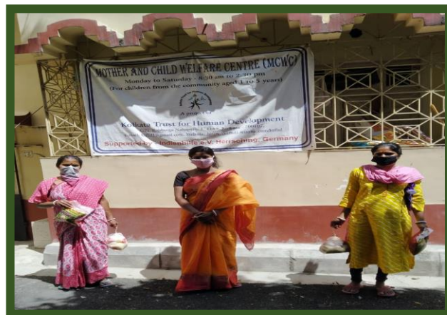
Pic 1 & 2: Mothers of the children attending MCWC crèche under KTfHD till 2019-20 were distributed dry ration as relief during lockdown period due to Covid pandemic.

Activity 2: Relief distribution - Besides awareness related work and campaigns, KTfHD felt the need to provide some direct support to some most needy families who were badly affected with the country wide lockdown started from end of March 2020. The families were selected with no livelihood and income source, they were left with no