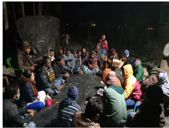
Picture 5&6: Community Meeting with local stakeholders at Burobottola, Ghoshpur (6.12.20 and Paruipara, Rasui respectively on 6.12.20 and 14.1.21 to mobilizing towards Safe Drinking Water project

This year KTfHD representatives also participated in Online Exchange Programme Online Exchange Programme with Two Municipalities (Hersching and Chatra) where KTfHD members supported on communication and advocacy (1.2.21)