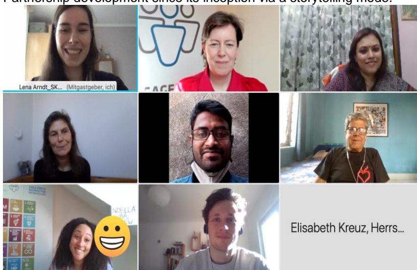
Picture 4: Story Telling by KTfHD representatives in Online Asia Conference on 02.03.2021